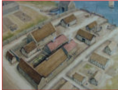
Dragon Hall site - 14th Century