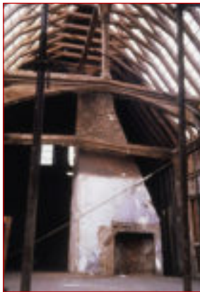
Restoration - 1980s