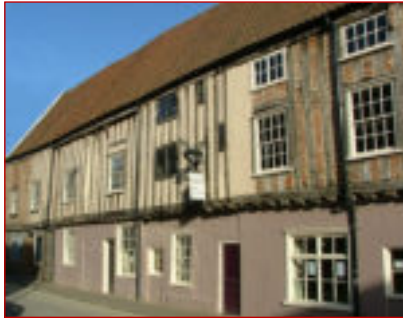
Dragon Hall - 21st Century