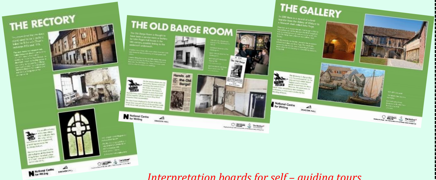
Interpretation boards for self – guiding tours