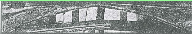
The medieval timber frame of Dragon Hall.