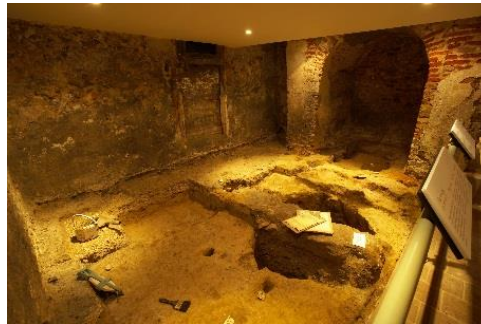
Excavation in 1987/88

The report of this excavation can be found in Brian Ayers: Digging Deeper – Recent Archaeology in Norwich (1987).