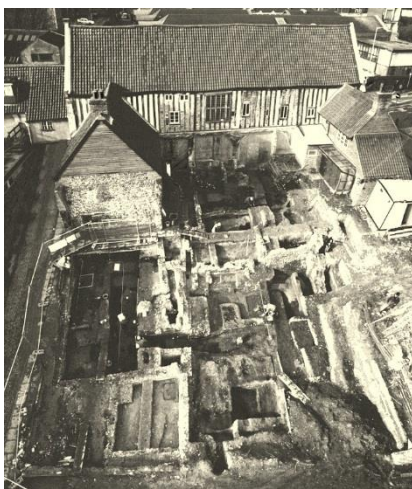
The dig in 1997/98

The full archive of the 1997 excavation is in the care of the Norfolk Museums service.